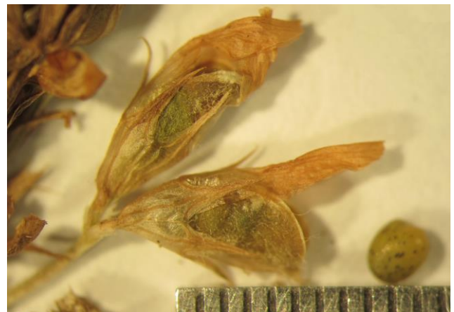
Fig. 1. The first Auckland region collection of bird's-foot clover in 61 years, from Motuhoropapa, The Noises. Note the faded 2-flowered inflorescence with immature pods; corolla > pod (with scattered hairs); pod > calyx; and a single seed from a mature pod. Scale divisions 0.5 mm. Collected 15 Dec 2015 (AK 359828).

collected on the Chatham Islands. Excluding the two historical Auckland records the next most northern collection is from a roadside at Hawaii Beach near